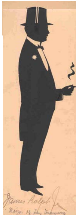
Silhouette of San Francisco's Mayor James Rolph